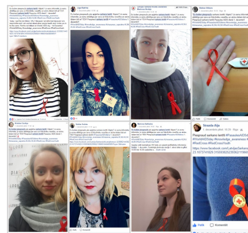
photo of themselves and to post it on facebook.com (and other social network) timeline by adding this message: “Today I am wearing a red ribbon. Why? Because I am aware, I am responsible for health of my friends and I invite YOU to do the same! Pin the red ribbon to your clothing today, on 1 December, on the World AIDS Day! #WorldAIDSday #RedCross RedCrossYouth #knowledge_awareness #PasaulesAIDSdiena ”

Latvian Red Cross Youth of Daugavpils city branch participated at the event „Rock Marathon against AIDS”. During the event LatRC youngsters distributed condoms and informative materials about HIV/AIDS, its impact on person's life, risks etc. to around 200 participants of the event. Also Latvian Red Cross Youth of Daugavpils city branch visited Daugavpils Secondary school's 60 students of the 9th grade. During the visit, they organized a knowledge competition in three parts: theoretical knowledge, case analysis, practical exercises. The main topics were spreading of the AIDS/HIV viruses and where to get help in case of being infected.